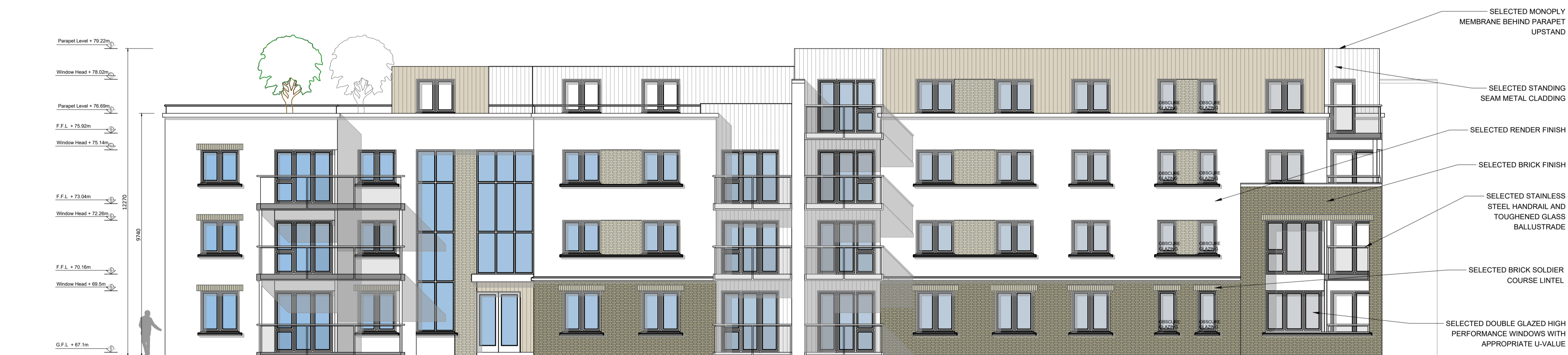
BLOCK L - SOUTH WEST ELEVATION