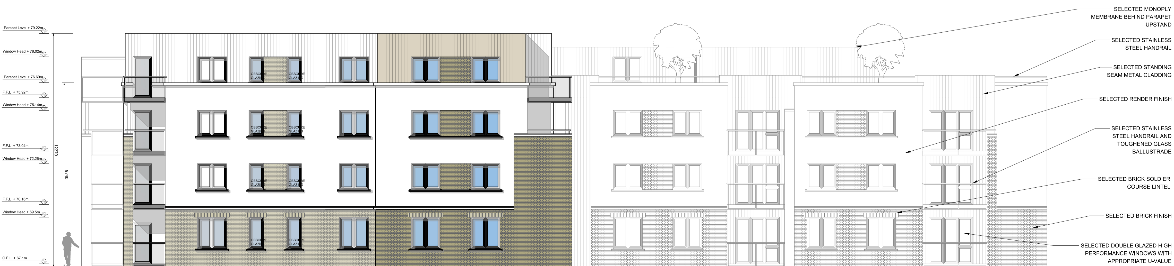
BLOCK L - NORTH EAST ELEVATION