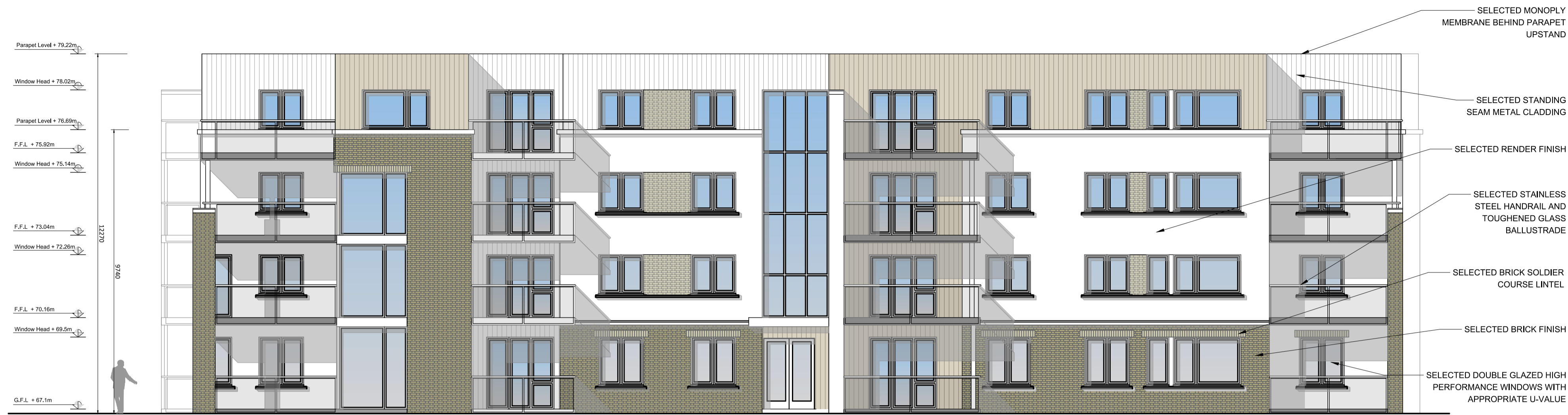
BLOCK L - SOUTH EAST ELEVATION